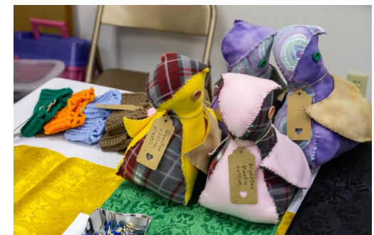
The table for the Dirty Half Dozen Largesse Derby was overflowing! The photos above show only a small sampling of what our populace created.