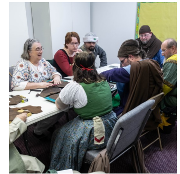
Six classrooms based on A&S, martial, and bardic topics ran throughout the day and were full of eager learners.