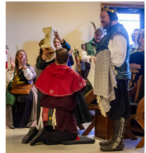
Many well-deserved awards were given at court.